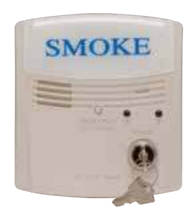
RTS2-AOS UL S2522