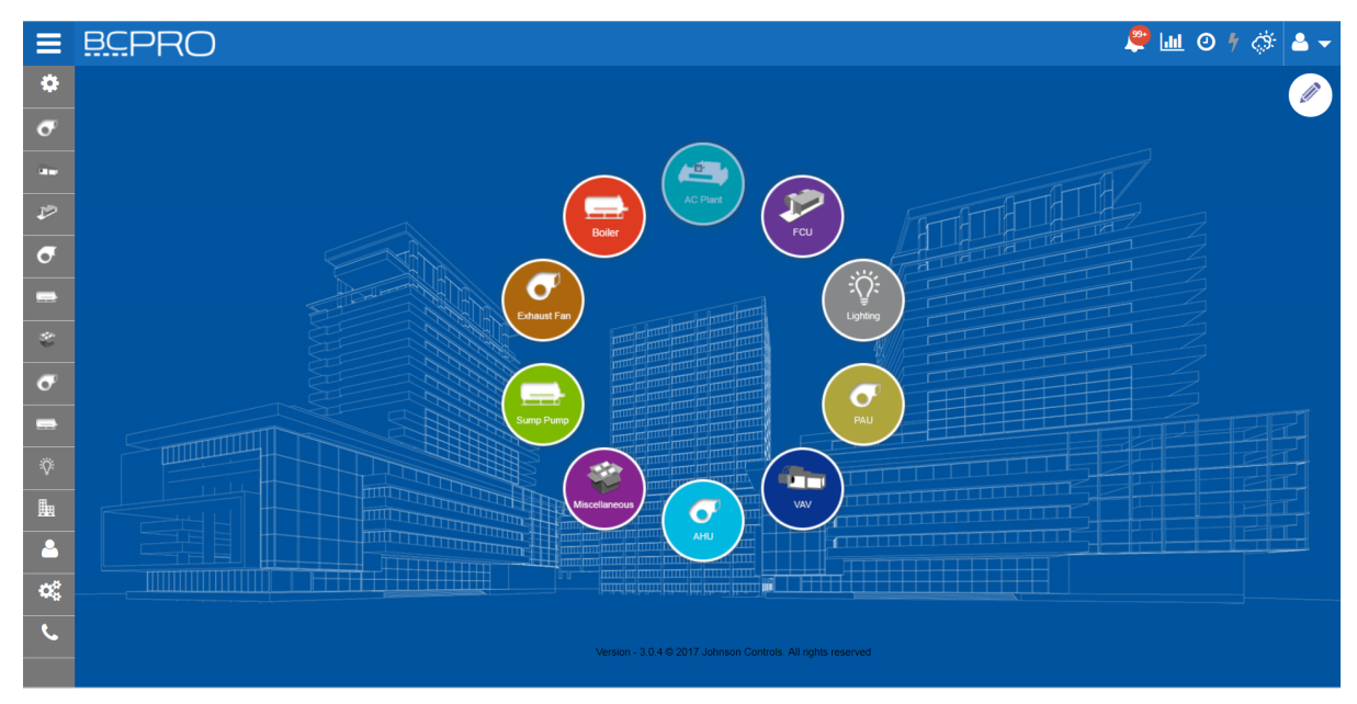
Figure 1: BCPro System Main Screen UI

Figure 1 shows the intuitive and easy-to-navigate UI screen for the BCPro system. In the library, you can also change the graphic on the home page. You have a choice between using the default image or uploading an image of your own.