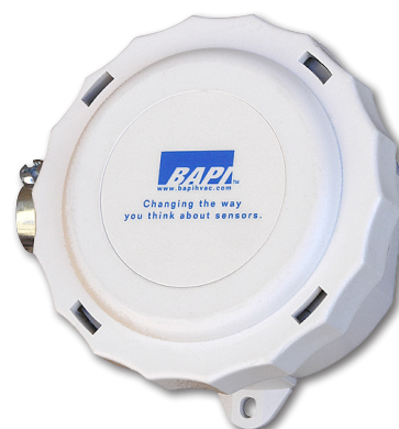
Carbon Monoxide Sensor without Display