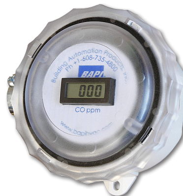
Carbon Monoxide Sensor with Display

BAPI's Carbon Monoxide Sensor offers enhanced, long life electrochemical sensing with outstanding accuracy at low concentrations. The sensor has a range of 0 to 100 PPM or 0 to 300 PPM of Carbon Monoxide with a resolution of 1 PPM and a linear output of 4-20 mA. The unit also features a robust enclosure and is available with or without LCD display.