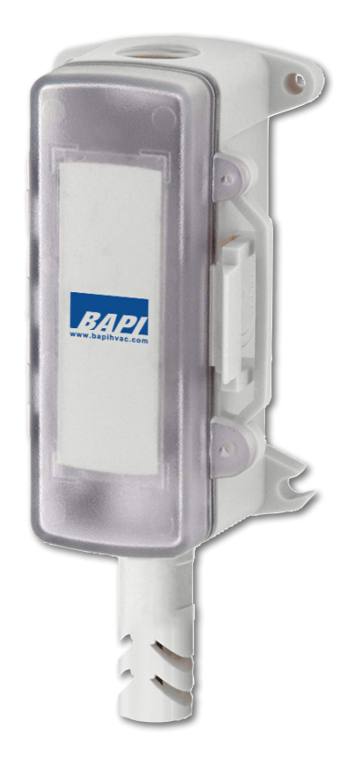
Outside Air Temperature Sensor in a BAPI-Box 2 Enclosure