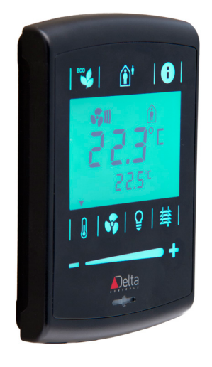
BBB: Black Button Overlay, Black Front, Black Back