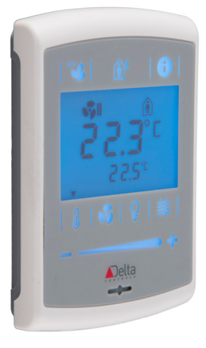
GWG: Grey Button Overlay, White Front, Grey Back