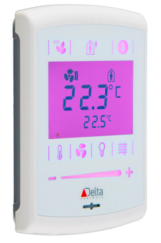
WWG: White Button Overlay, White Front, Grey Back