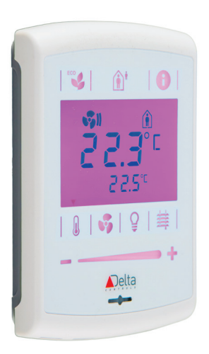
WWG: White Button Overlay, White Front, Grey Back