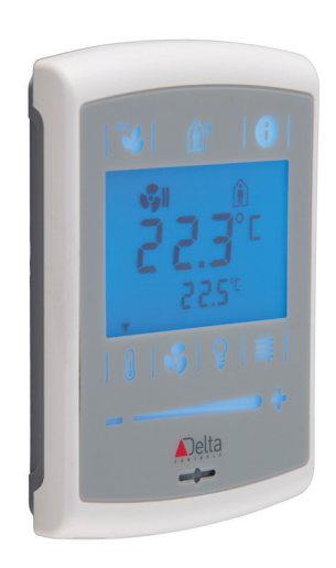
GWG: Grey Button Overlay, White Front, Grey Back