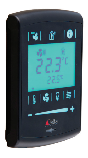
BBB: Black Button Overlay, Black Front, Black Back