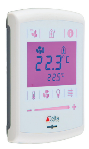
WWG: White Button Overlay, White Front, Grey Back