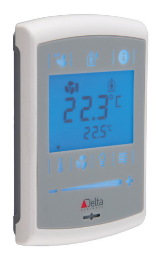
GWG: Grey Button Overlay, White Front, Grey Back