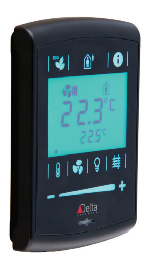
BBB: Black Button Overlay, Black Front, Black Back