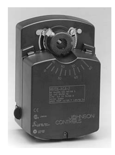
Figure 1: M9106-xGx-2 Non-spring Return Actuator

The M9106-xGC-2 models are available with integral auxiliary switches to perform switching functions at any angle within the selected rotation range. GGx models feature 0 to 10 VDC position feedback, and the AGF models provide 10,000 ohm position feedback.