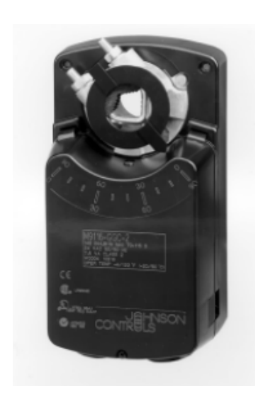
Figure 1: M91xx Series Actuator

A single M91xx model delivers up to 280 lb·in (32 N·m) of torque. Two AGx, GGx, or HGx models in tandem deliver twice the torque or 560 lb·in (64 N·m). The angle of rotation is mechanically adjustable from 0 to 90° in 5-degree increments. Integral auxiliary switches are available to indicate end-stop position or to perform switching functions at any angle within the selected rotation range. Position feedback is available through switches, a potentiometer, or a 0 (2) to 10 VDC signal.