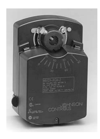
Figure 1: M9109 Non-spring Return Actuator

The M9109 models have an 80 lb·in (9 N·m) running torque. They have a nominal 60-second travel time for 90° of rotation at 60 Hz (72 seconds at 50 Hz) with a load-independent rotation time. The M9109-AGC-2 models are available with integral auxiliary switches to perform switching functions at any angle within the selected rotation range.