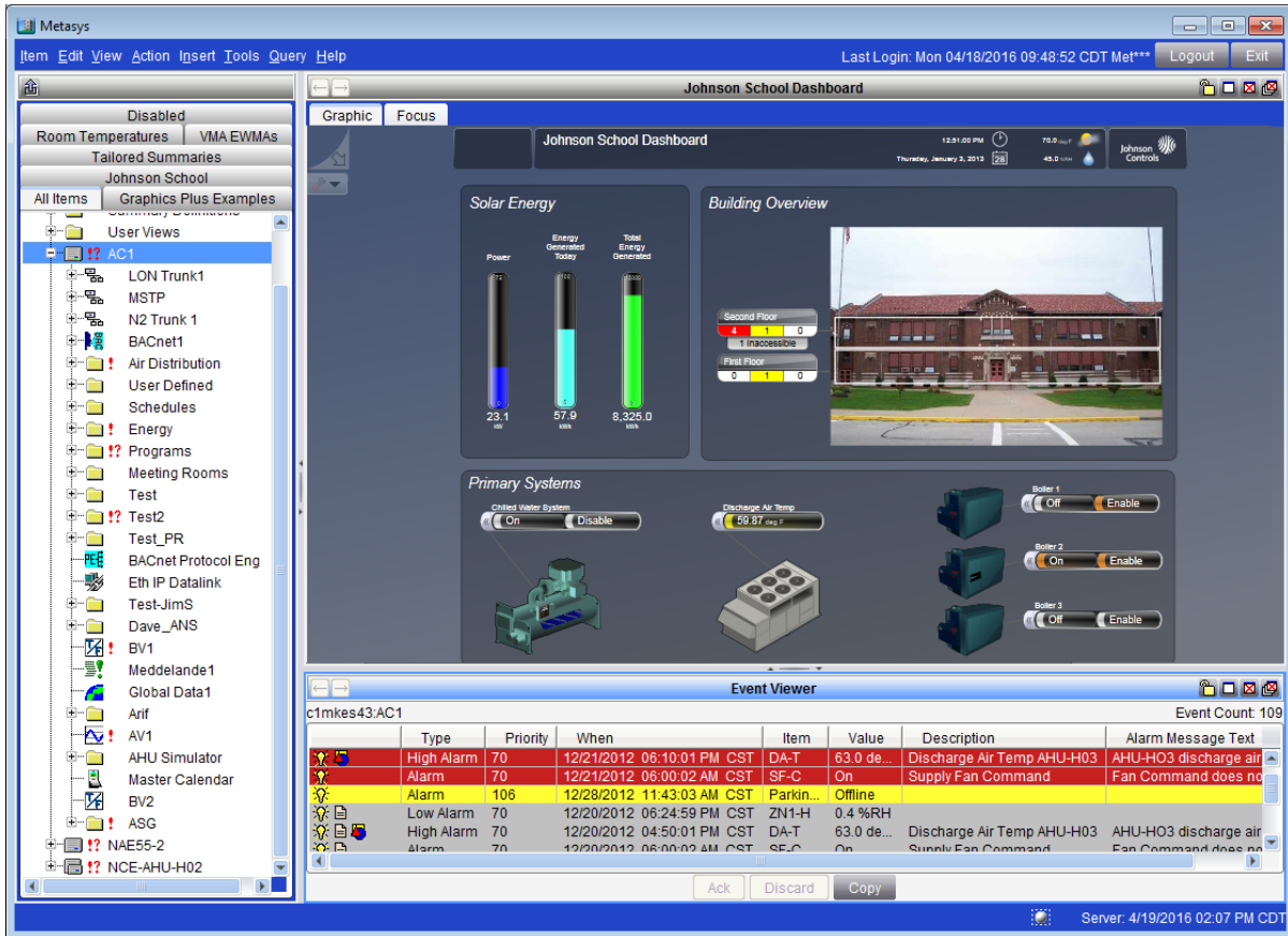
Figure 1: Site Management UI

The Metasys system can communicate with cloud-based applications easily and securely. To make this connection, the Metasys system requires minor programming and setup by Johnson Controls. When you are connected, you can access multiple cloud-based applications and features. To learn more, please visit the Building Management page located on the Johnson Controls® website.