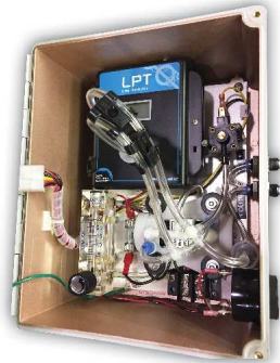
Inside of the DCC-MRI showing the LPT-A with Oxygen sensor.

For the most accurate calibration a demand flow regulator should be used, connected to the DCC-MRI system with the flow rate of the DCC-MRI system set to 1.0 LPM after the length of tubing to be used has been connected. The tubing should not exceed 50 ft or 20 m.