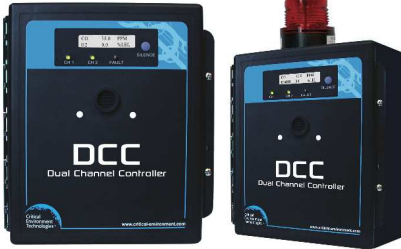
DCC shown with Option L

The DCC Dual Channel Controller is a comprehensive and dependable, self-contained system that offers one or two channel configurations for monitoring toxic and combustible gases and PID TVOCs with straightforward control functionality for non-hazardous, non-explosion rated, commercial and light industrial applications.