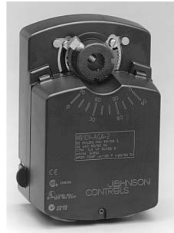
Figure 1: M9109 Non-spring Return Actuator

The M9109-GGx-2 models have an 80 lb-in (9 N·m) running torque. They have a nominal 60-second travel time for 90° of rotation at 60 Hz (72 seconds at 50 Hz) with a load-independent rotation time. The M9109-GGC-2 model is available with integral auxiliary switches to perform switching functions at any angle within the selected rotation range. Position feedback is available through a 0 (2) to 10 VDC signal.