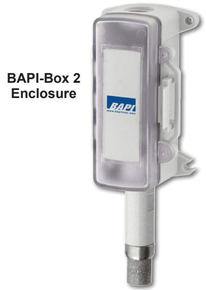
BAPI-Box 2 Enclosure

The Outside Air Units are also extremely dependable, featuring two of the most watertight enclosures available today. The BAPI-Box and BAPI-Box 2 are made of UV-resistant polycarbonate and carry an IP66 rating. The BAPI-Box is only available for units with a temperature transmitter and a humidity transmitter.