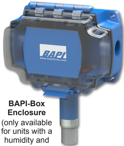
BAPI-Box Enclosure (only available for units with a humidity and temperature transmitter)